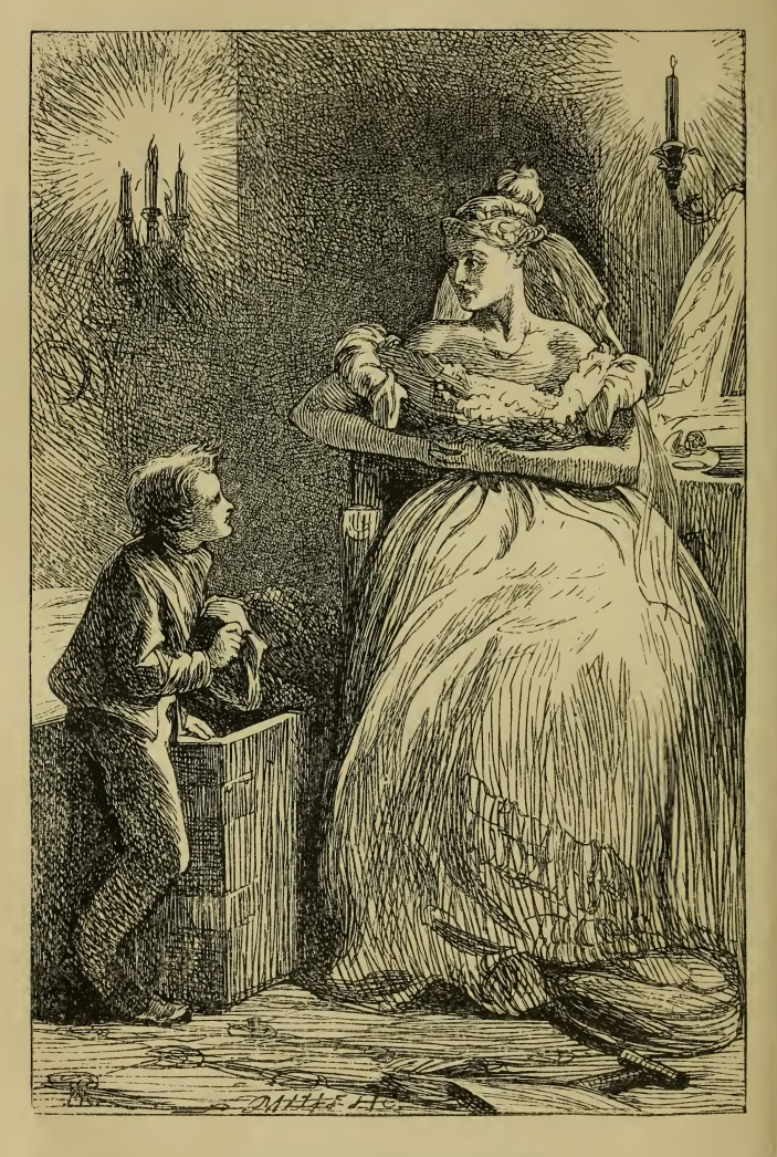
PIP WAITS ON MISS HAVISHAM.